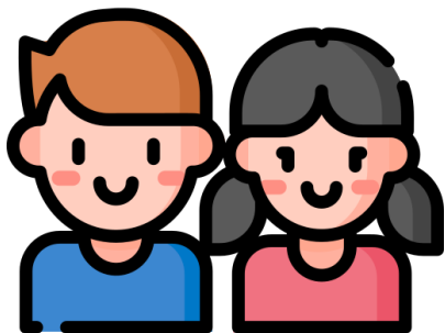
0-6 years old