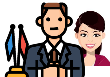
Diplomats and their families