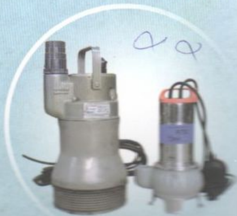
● Pompe Elec Submersible PSP110P180